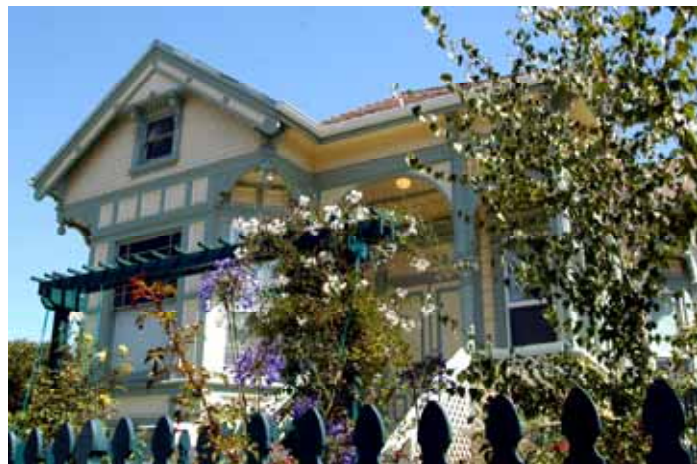
Below. The Myrtle House, one of two Sophia Project homes in West Oakland.